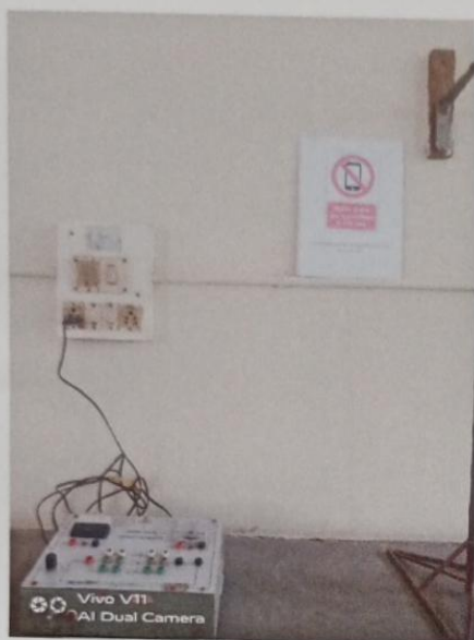
Department of Physics