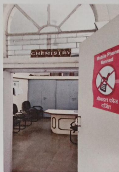
Department of Chemistry